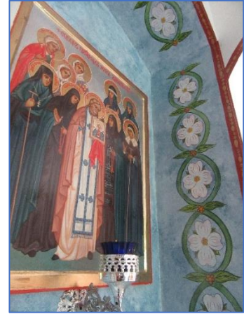
The completed border around the icon of the Divevevo nuns.

way (and lead others) in a challenging world. May God help us! However, this is why the spiritual oases of aesthetic theology as found in monastic abodes are so necessary – they are havens where the faithful may "recharge their spiritual batteries".